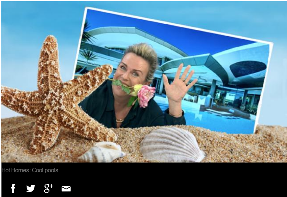
Hot Homes: Cool pools